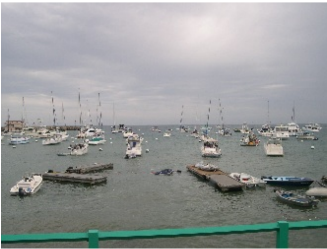
Same dinghy docks different view