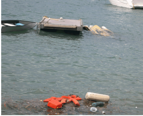
Part of the dinghy dock between the clubs