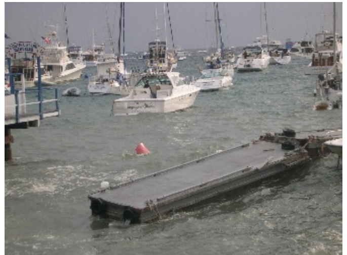
As you can see the Catalina Yacht Club wisely pulled their floats before the winter storms hit

Most of the year Avalon and Catalina Island is a beautiful place to visit. However, it is no place to be when the winds come from the mainland. While the dreaded Santana Winds can be forecasted one never knows if they will effect the Island. On the day of this storm, which started around 5:00 A.M., it was an overcast morning and a small craft warning was issued. Just six miles off-shore, north of the island, the seas were flat and the winds calm. By noon the seas had subsided and most of the visiting boaters were on their way back to the mainland. One interesting point, in the morning as I watched the mayhem in the harbor, I chuckled as the sailboats were hoisting sails and leaving, ever so eager to sail in the 25+ knot winds, and the power boaters sat in the harbor and bounced around like corks in the bathtub. That may have been sweet revenge for all the times they beat me into the harbor to get the better moorings.