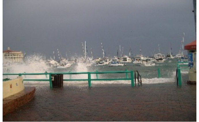
This is the small plaza next ton Antonio's Cabaret